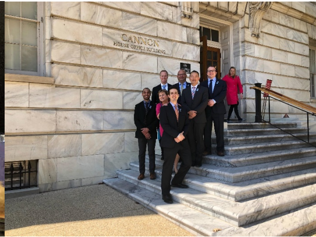
UTCANJ and UCA of Illinois Cross Paths on the Hill