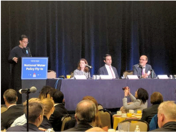
Congressional Staff Roundtable

The events held on Wednesday, April 3 rd included a briefing on US EPA priorities related to water and discussions related to infrastructure funding, water reuse / security, CSOs, and PFAS and other CWA / SDWA issues. The formal events of the day ended with a reception at the Library of Congress featuring Senator Tom Carper (D-DE), Ranking Member, US Senate Environment Public Works Committee.