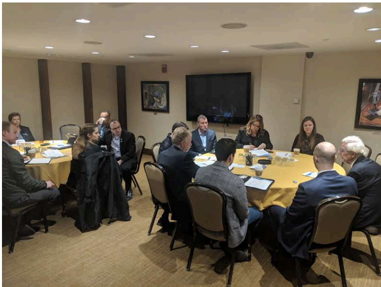
CWCC Member Briefing